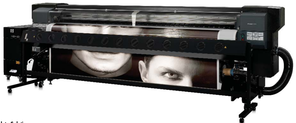
HP Designjet 10000s Complete Solution